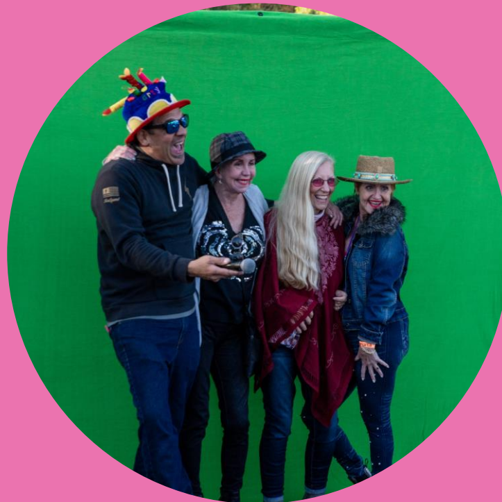
Photobooth Green Screen