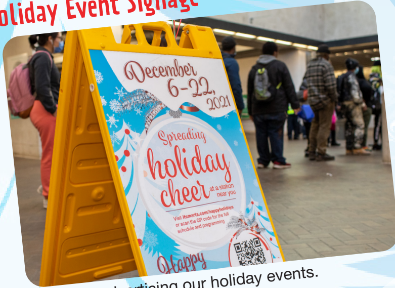
A-frames advertising our holiday events.