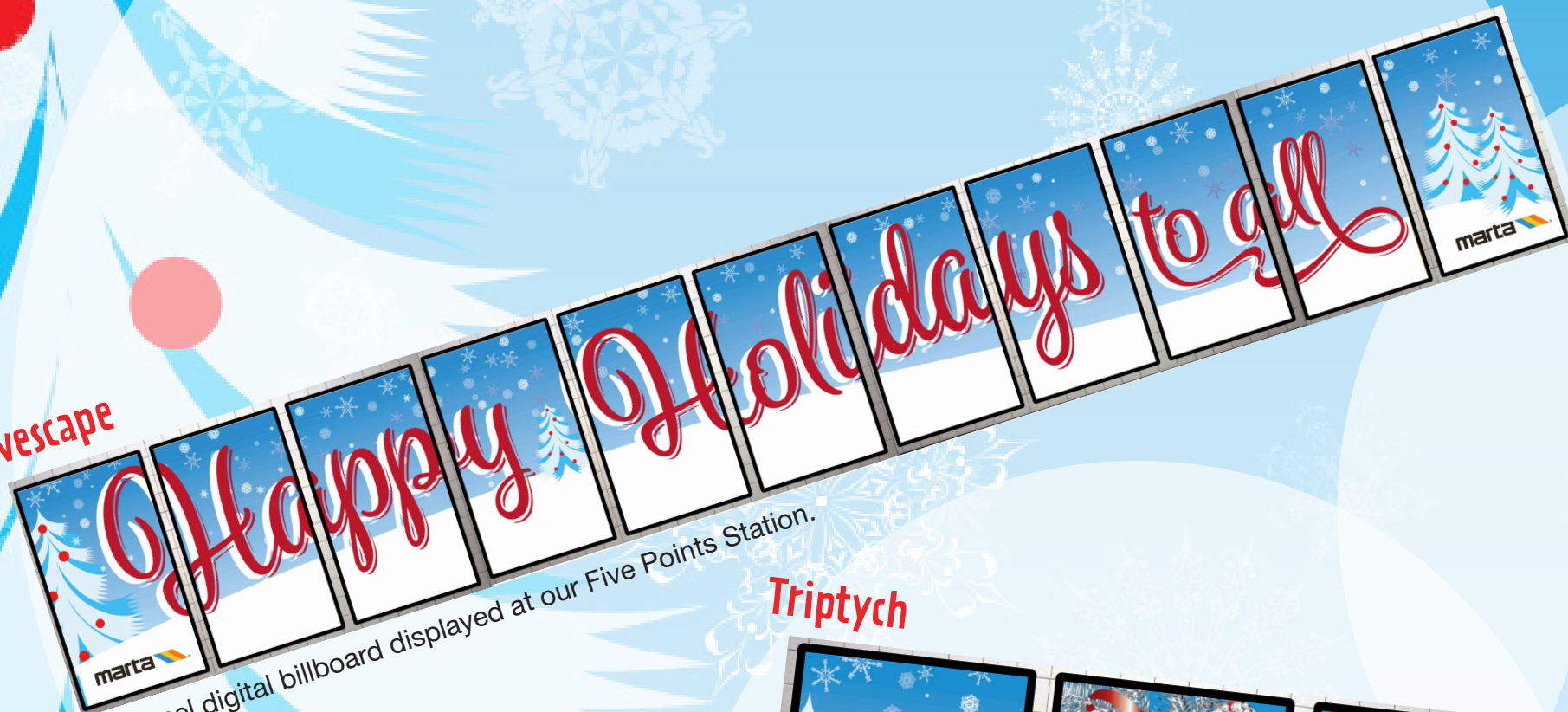
11-panel digital billboard displayed at our Five Points Station.