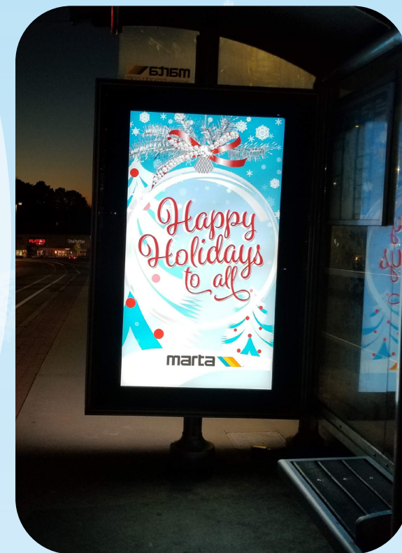
Wishing all a happy holidays at one of our Bus Shelters in Brookhaven.