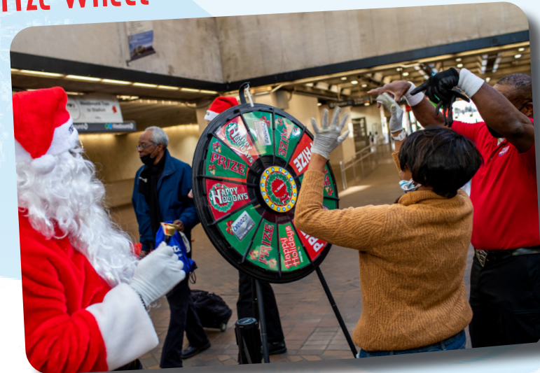
Customer winning a 7-day Breeze card!