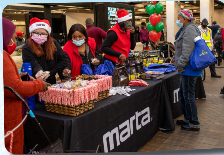
Engaging with customers!