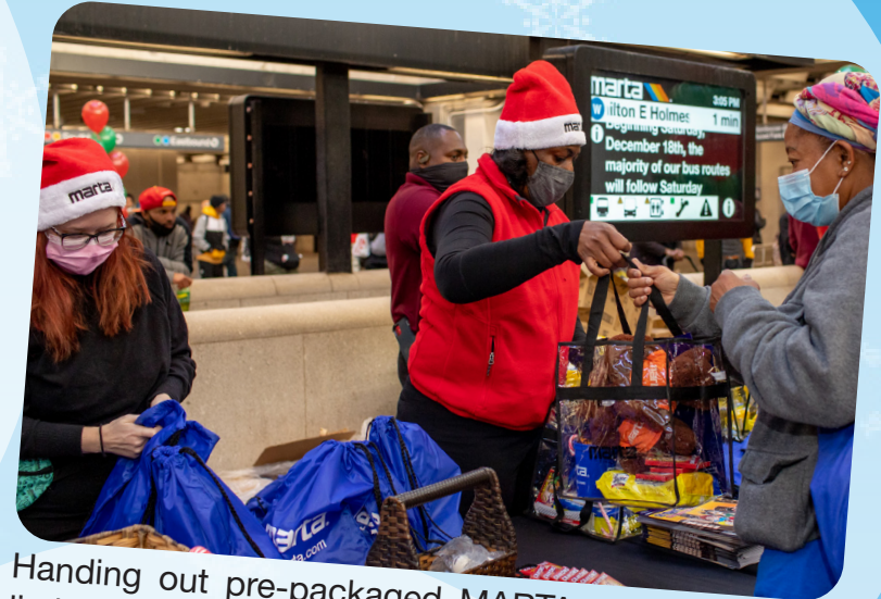
Handing out pre-packaged MARTA swag to help limit the spread of COVID-19.