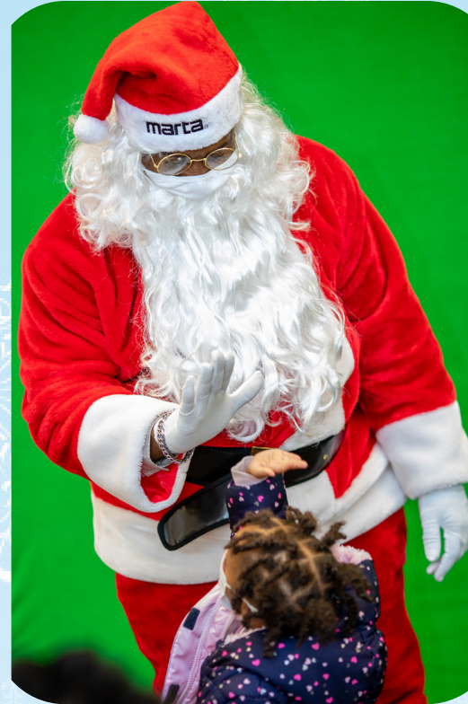
Santa greeting a young MARTA rider.