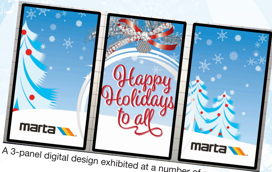
A 3-panel digital design exhibited at a number of our stations.